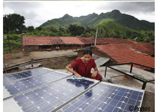
The GHG emission reduction indicators help track the impacts of USAID Clean Energy programs.